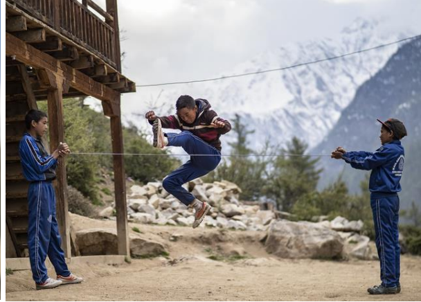
children playing at the school home.

And the success continues. Now teaching is also carried out in class 11 for some subject areas and next year also for class 12. Not only that, now there will also be an agricultural education, which we have been calling for since our first meeting with the school. In March 2020, an agricultural education starts for the classes 9 to 12. Two new teachers have been hired. Traineeships will also be included. The teachers in English now have higher education than before why we expect the children to be better in English.