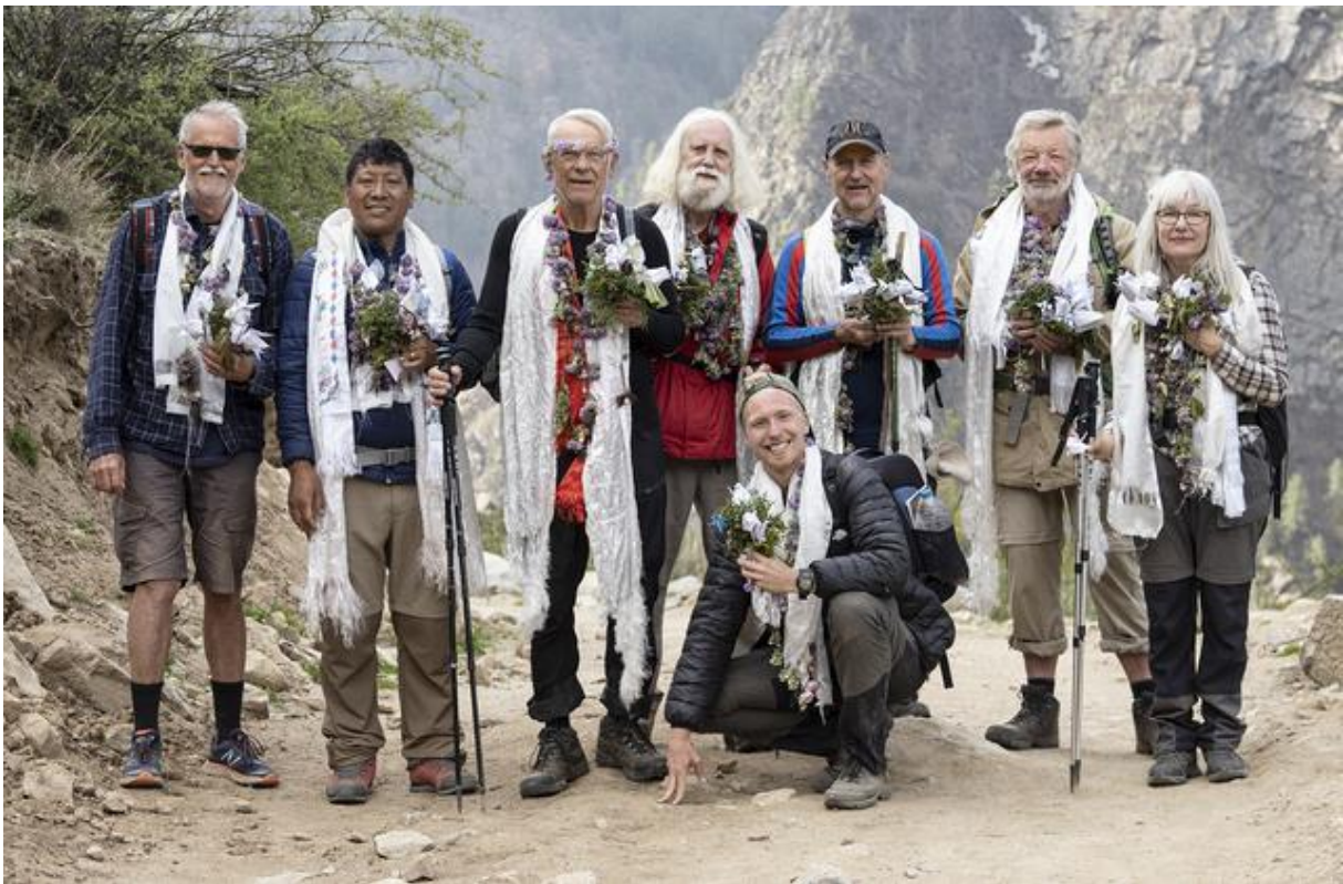
The group after we have said Good Bye to the children.

Do you no longer want our mailings? Cancel Here >>