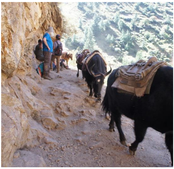
The animals go blithely closest to the precipice.

The four boys, who wrote their final exams after grade 10 in April, have now received their results and they have all passed the test. This means that they are entitled to study further, which they all want to do. We congratulate them, and hope that we can find