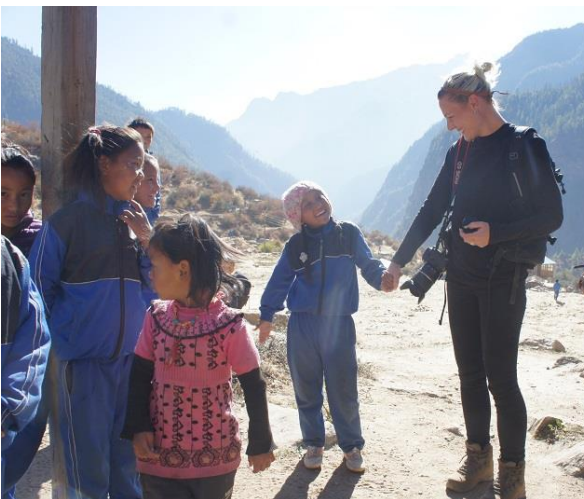
"Come and play with me".

According to Chembal the first greenhouse in Humla was built by KMCH. It was in 2010, when KMCH rented a house in the village of Yangar. The greenhouse was financed by