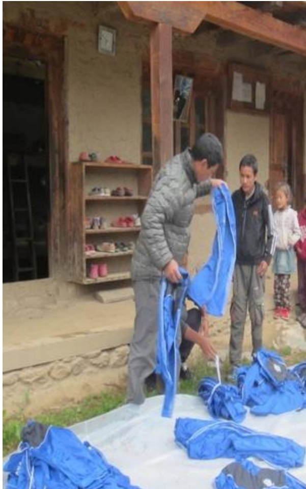
Distribution of clothes and shoes takes place regularly.