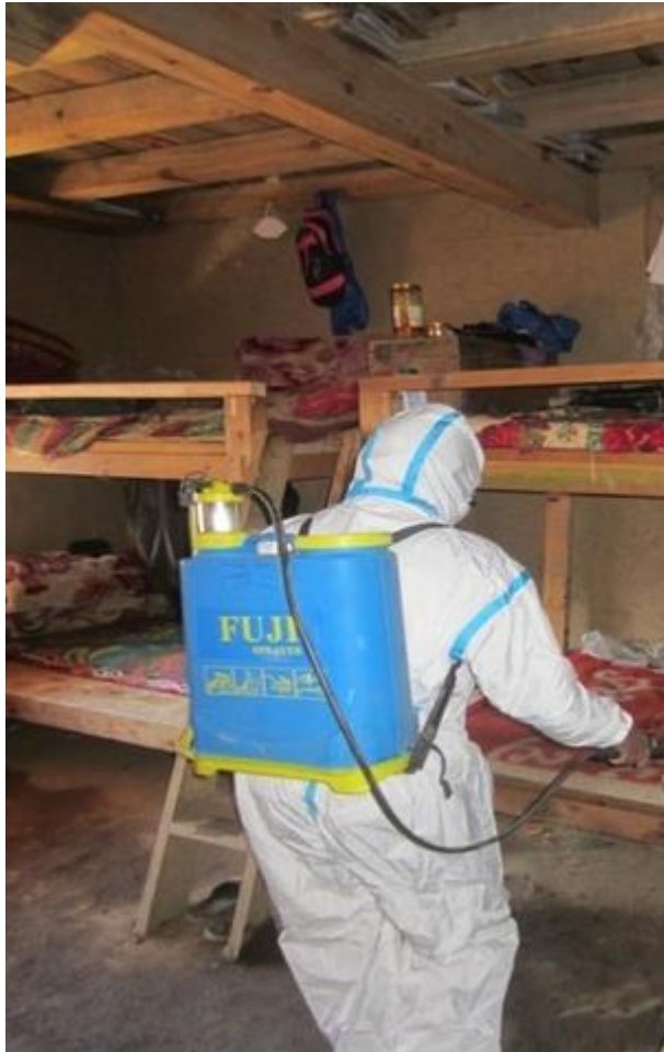
Not only face masks and hand sanitizer were used as coronaprevention.

During the year, the children have been able to wash themselves in solar-heated hot water, which is much appreciated. A lot has happened since we camped in the area in 2011, which was then almost virgin land. However, it can be even better.