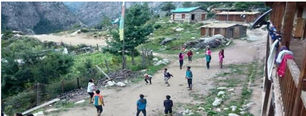
Play outside the school home far from the politicians' squabbles

An equally big topic is the Nepal Communist Party and how they have acted in parliament since September. In protest against the speaker of the parliament the party has completely obstructed the parliamentary work. I have watched recordings from the Parliament and it is sad to see NCP Members leaving their seats, chanting slogans and making the duties of Parliament impossible. And this happens every time Parliament gathers for debates and discussions.